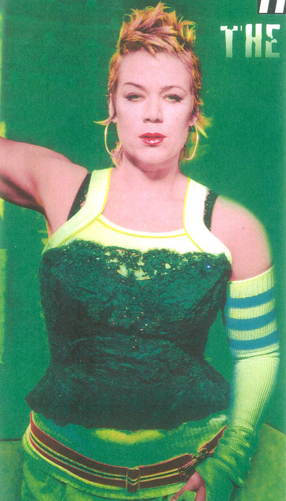
Mia Michaels is a world-renowned choreographer. She was recently awarded her first Emmy Award for Outstanding Choreography for "Calling You," created in 2006 for Fox's So You Think You Can Dance . Mia has been collaborating creatively and as a regular columnist for movmnt since its inception.